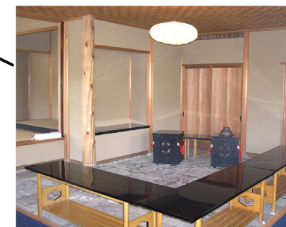
Ryureiseki - Tea ceremony with bench and table. (Seats approx. 12~15 guests) [25m 2 ]