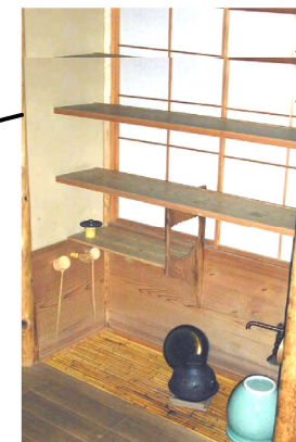
Mizuya - Preparation room.