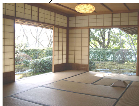
Hiroma - Large tearoom (Seats approx. 13~15 guests) [19m 2 ]

The adjoining Hiroma & Ryurei are divided by 2 removable fusuma sliding paper doors, and may also be used as separate tearooms.