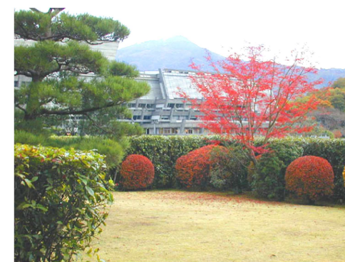
Nodateseki - Enjoy tea outside. [280m 2 ]

The adjoining Hiroma & Ryurei are divided by 2 removable fusuma sliding paper doors, and may also be used as separate tearooms.