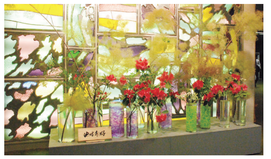
The 53rd Annual Meeting of the Japanese Association of Rehabilitation Medicine In The Lounge at the Kyoto International Conference Center

of flowers. Further, since the Great East Japan Earthquake, the number of students taking ikebana classes in university, including male students, has increased. I believe that they may be facing ikebana with their own sensibilities, wishing to learn about a culture that came to coexist with nature.