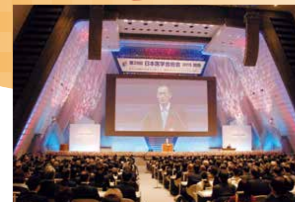
"The 29th General Assembly of the Japanese Association of Medical Sciences 2015 Kansai"

Dr. Yamanaka: Since developing new technologies takes a lot of time, the first goal is to make our institute a sustainable organization that can hold steady over the next 10, 20, even 30 years. In that respect, it is important to ensure that we are financially sound, so we are focusing on raising contributions for our iPS Cell Research Fund and reaching out to a wide range of citizens for support. Also, although this may sound repetitive, in this day and age you cannot generate anything without