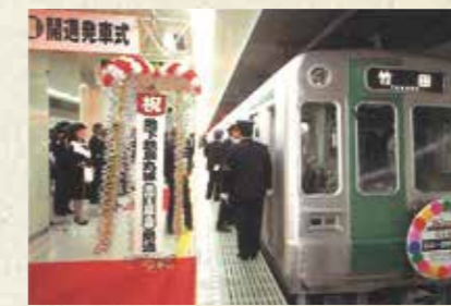
Opening of the Kyoto City Subway Karasuma Line, and opening of Kokusaikaikan (International Conference Center) Station (1997)