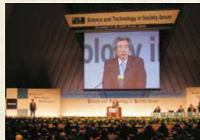
Science and Technology in Society forum (STS forum) (2004)