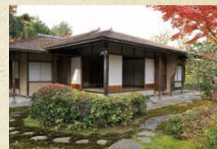
Completion of the Hoshio-an Tea House (1967)