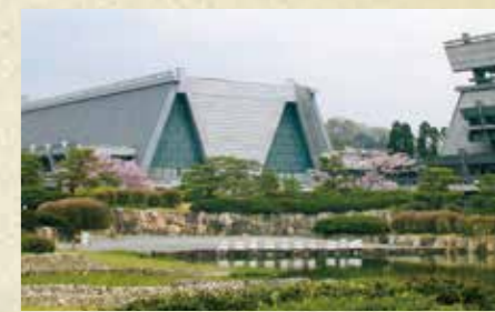
Completion of the Annex Hall (1998)