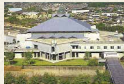
Completion of the Event Hall (1985)