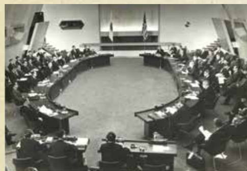
The Fifth Meeting of the U.S.-Japan Joint Committee on Trade and Economic Affairs (1966)