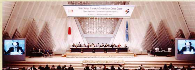
The Third Conference of the Parties to the United Nations Framework Convention on Climate Change (COP3) (1997)