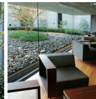
A special garden viewable from the lounge