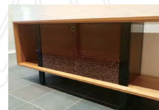
Ornament shelving: Sashimono woodcraft framing and lacquered door decorated with maki-e design and raden craftwork