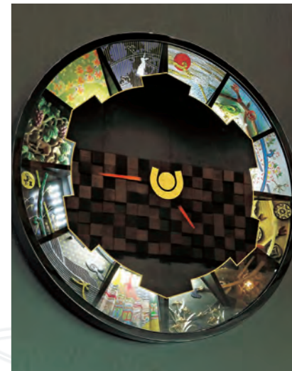
A clock displaying fifteen traditional craft techniques like nishijin brocade on its panels