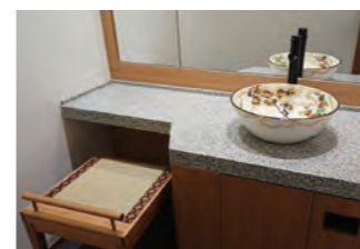
Restroom facilities: Kyoto ware and Kiyomizu ware hand-washing bowls and handmade Kyoto tatami stools