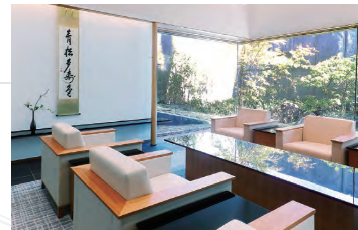
Reception Room: Nishijin brocade coated cloth armchairs and a black lacquered central table