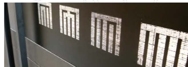
"Aluminum processed board" art panels engraved with traditional patterning (genjikomon)