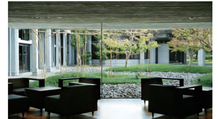
The lobby area boasts a "wipe-lacquering" finished lounge chair set for a sophisticatedly relaxing ambiance