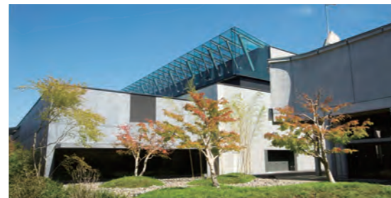
New Hall exterior

hub for Japanese international conferences in Kyoto, a city that has captured the eye of the entire world. Additionally, local Kyoto residents felt very strongly about wanting Kyoto to develop in brand new ways. These two driving forces resulted in the birth of the Kyoto International Conference Center. It was because Kyoto is what it is that this Center was born. And being located in Kyoto is what has allowed it to continue being an international conference center capable of representing Japan. Contributing to the ongoing development of the city of Kyoto: that is the important role of the Center. And I will always continue to ask myself if there is more we can do to inspire those who visit the International Conference Center to go out into the city and learn firsthand about Kyoto history, culture, lifestyles, and industry.