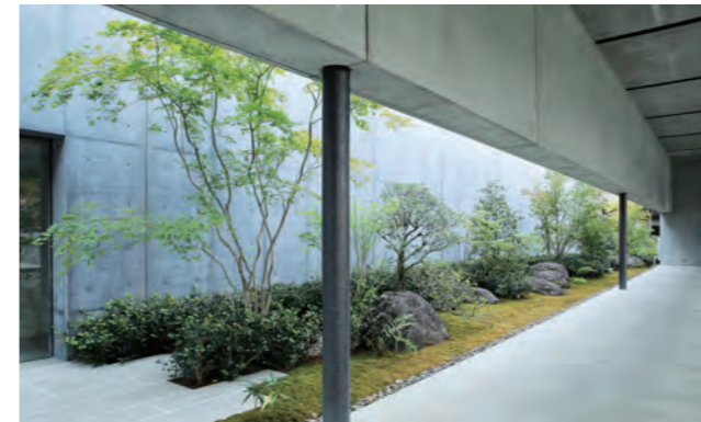
Experience nature at the "Byobu Garden" with seasonally changing forest-village beauty