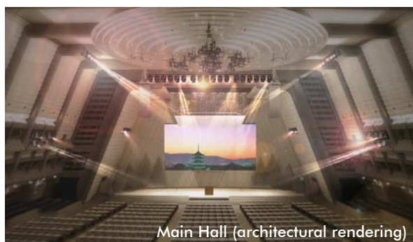
Main Hall (architectural rendering)

The size of Room A's permanent screen greatly increased (from 4.6m*6m to 5m*8.8m). The newest type of lighting and air conditioning facilities were installed, further enhancing the comfort level of the room.