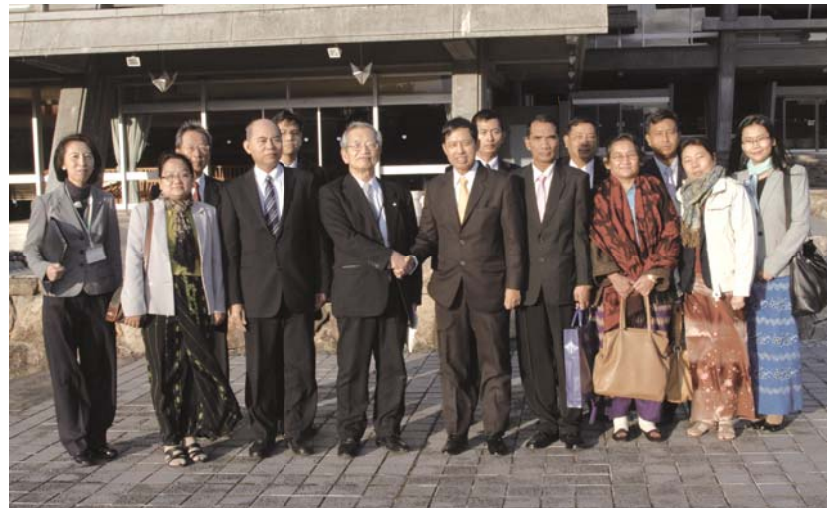
Center left: President of ICC Kyoto Right: Vice Minister of Foreign Affairs of Myanmar

Looking ahead to chairpersonship of ASEAN in 2014